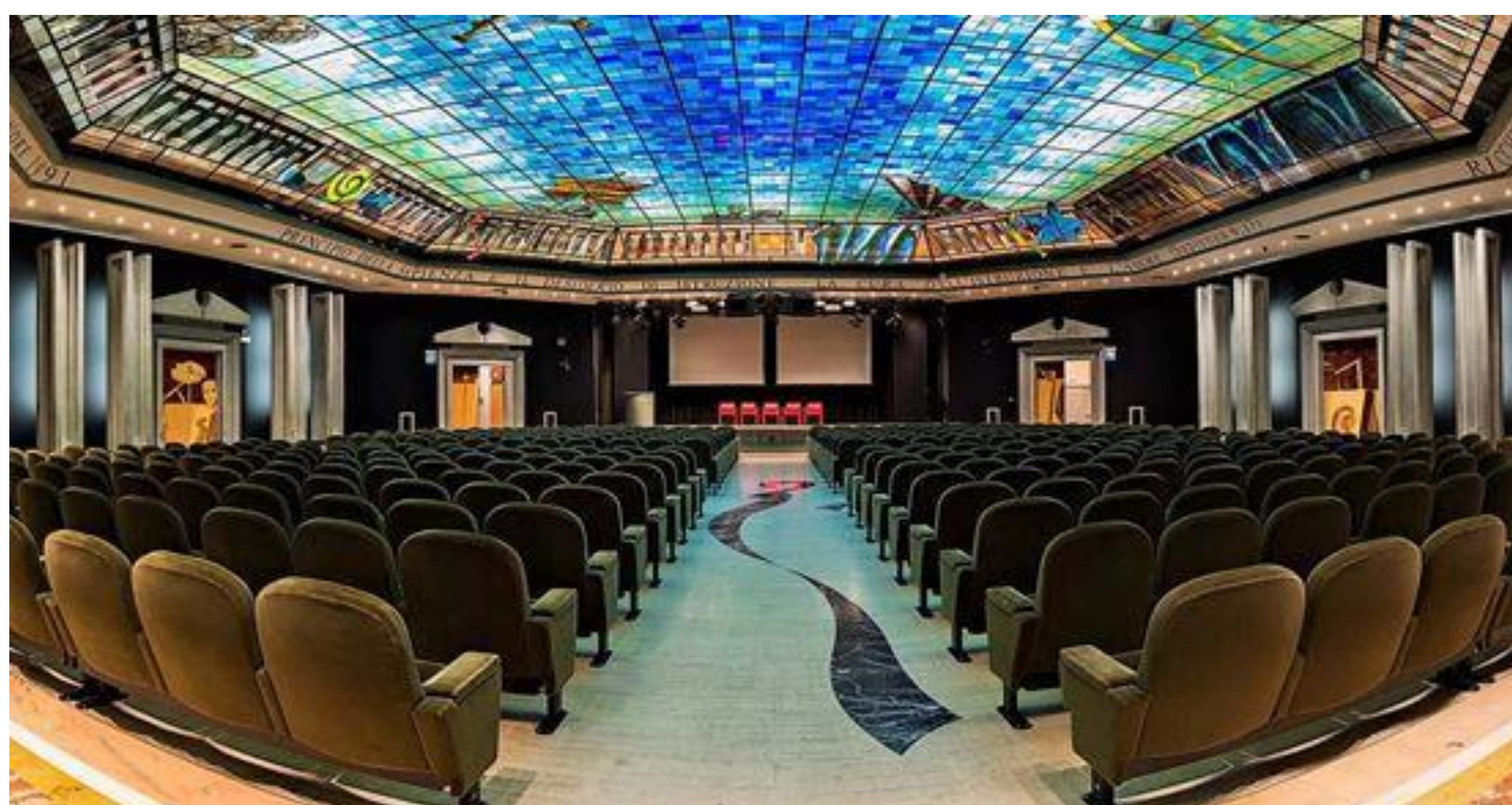
CENTRO CONGRESSI “GIOVANNI XXIII”